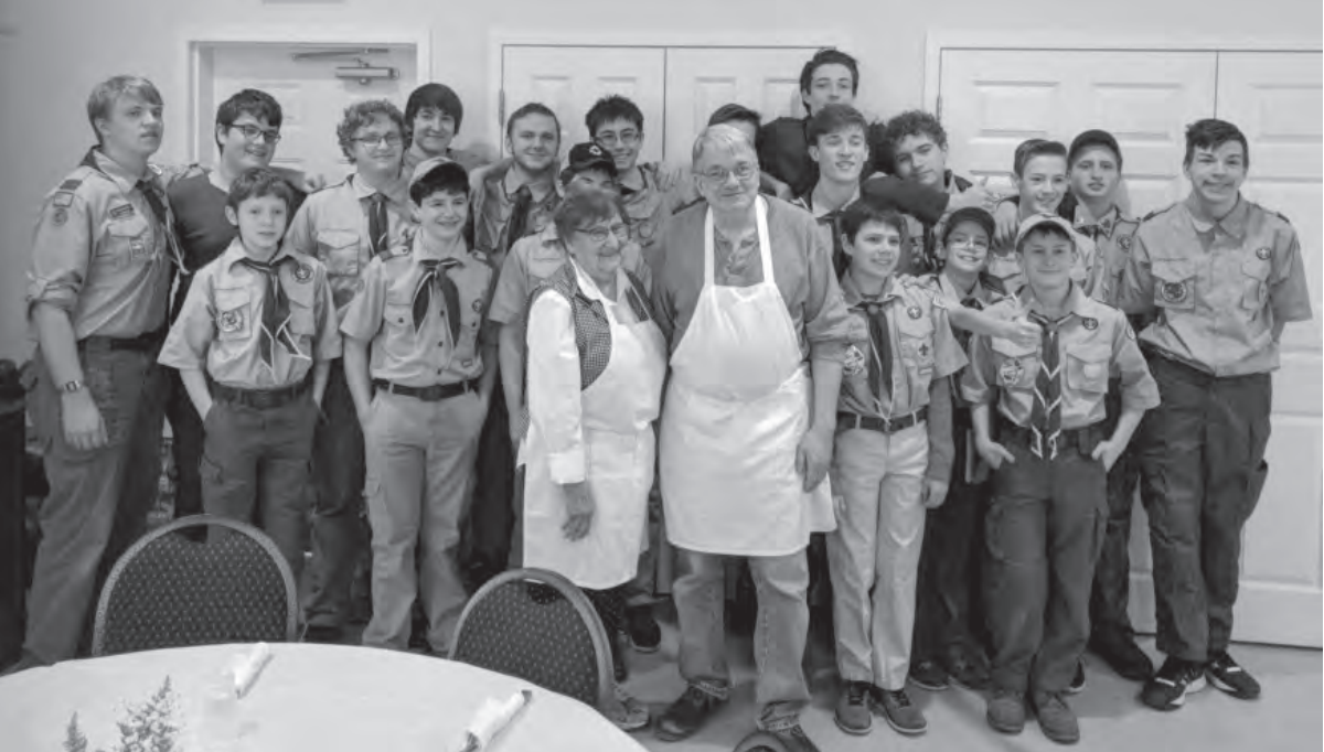
East Haddam Boy Scout Troop 22 is holding its annual Pasta Dinner on Saturday, March 14 from 5 to 7 p.m. at the East Haddam Senior Center. The entertainment for the evening will be provided by the scouts themselves. This is a fundraiser for the troop. The cost for dinner and dessert (and entertainment) is $10 for adults, $7 for seniors and children 12 and under. Tickets are on sale at the door and take out is available.